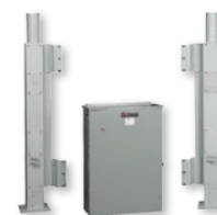
SwingRiser 30 single SwingRiser 30-twin

1,600 lb (726 kg) gate 19 second open Up to 16 ft (5 m) wide each leaf