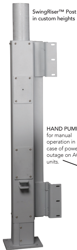
SwingRiser™ Post in custom heights