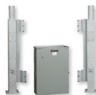
SwingRiser 19 single SwingRiser 19-twin

1,000 lb (453 kg) gate 14 second open Up to 9 ft (3 m) wide each leaf